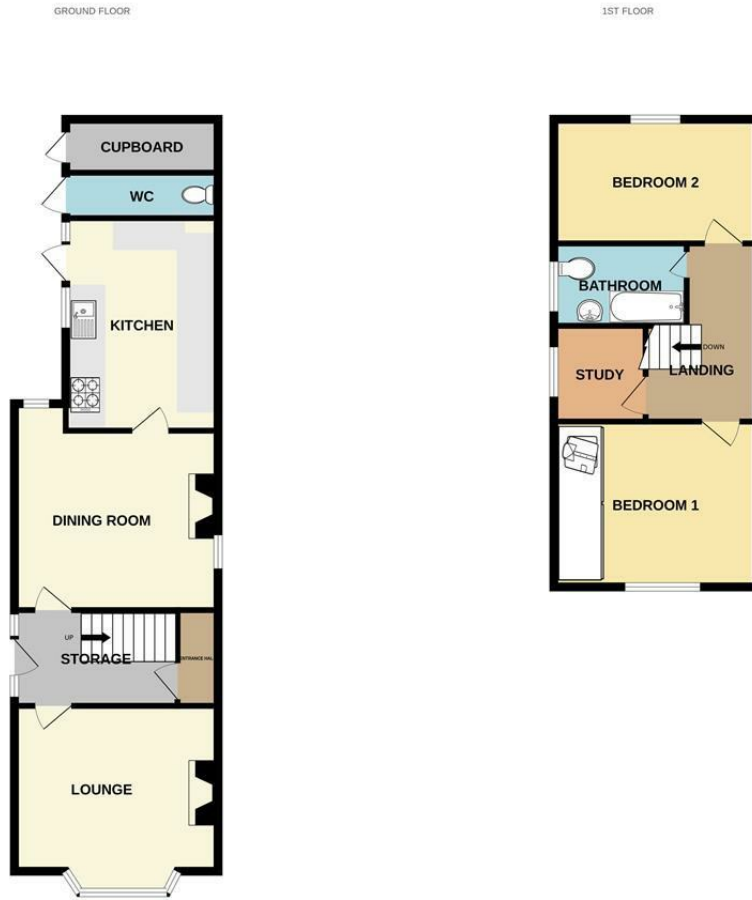
16 LONG LANE, ATTENBOROUGH

Whilst every attempt has been made to ensure the accuracy of the floorplan contained here, measurements of doors, windows, rooms and any other items are approximate and no responsibility is taken for any error, omission or mis-statement. This plan is for illustrative purposes only and should be used as such by any prospective purchaser. The services, systems and appliances shown have not been tested and no guarantee as to their operability or efficiency can be given. Made with Metropix ©2022